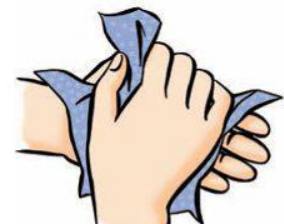
(h) Dry thoroughly with a clean towel