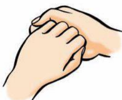
(e) Grip the fingers on each hand