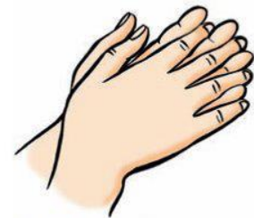
(d) Make sure the soap gets in between the fingers