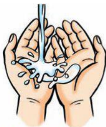
(a) Wet hands under running water

Follow the following procedure when applying Hand Sanitiser