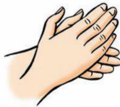
(b) Apply soap and rub palms together to ensure complete coverage