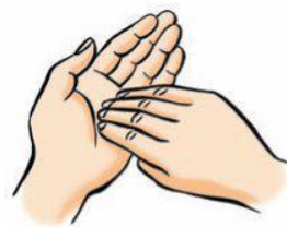
(g) Press fingertips into the palm of each hand