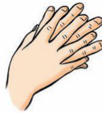
(c) Spread the lather over the backs of the hands